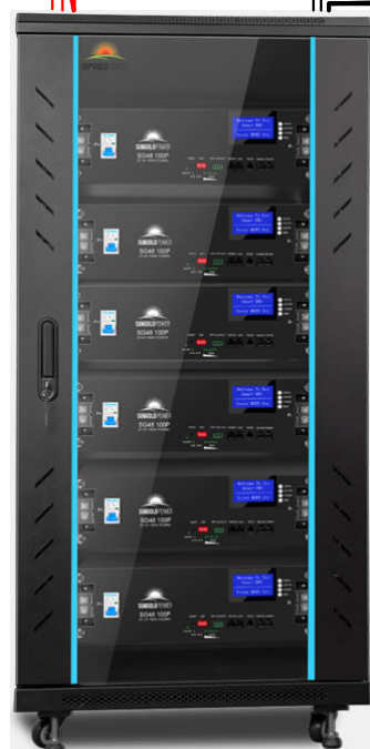
6*100AH 48V LIFEPO4 BATTERY (PARALLEL in CABINET)