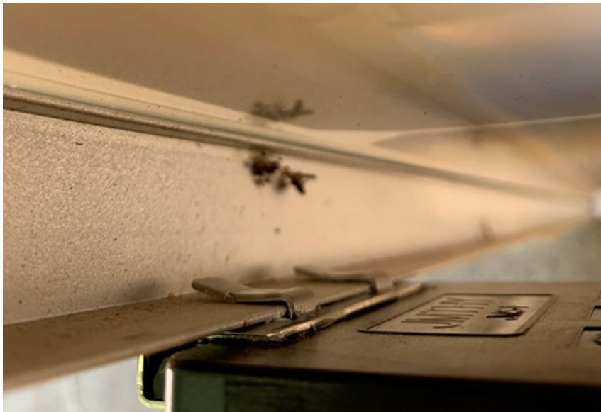
FIGURE 3 Correctly mounted JMS-F showing grounding "teeth" correctly engaging solar PV module frame