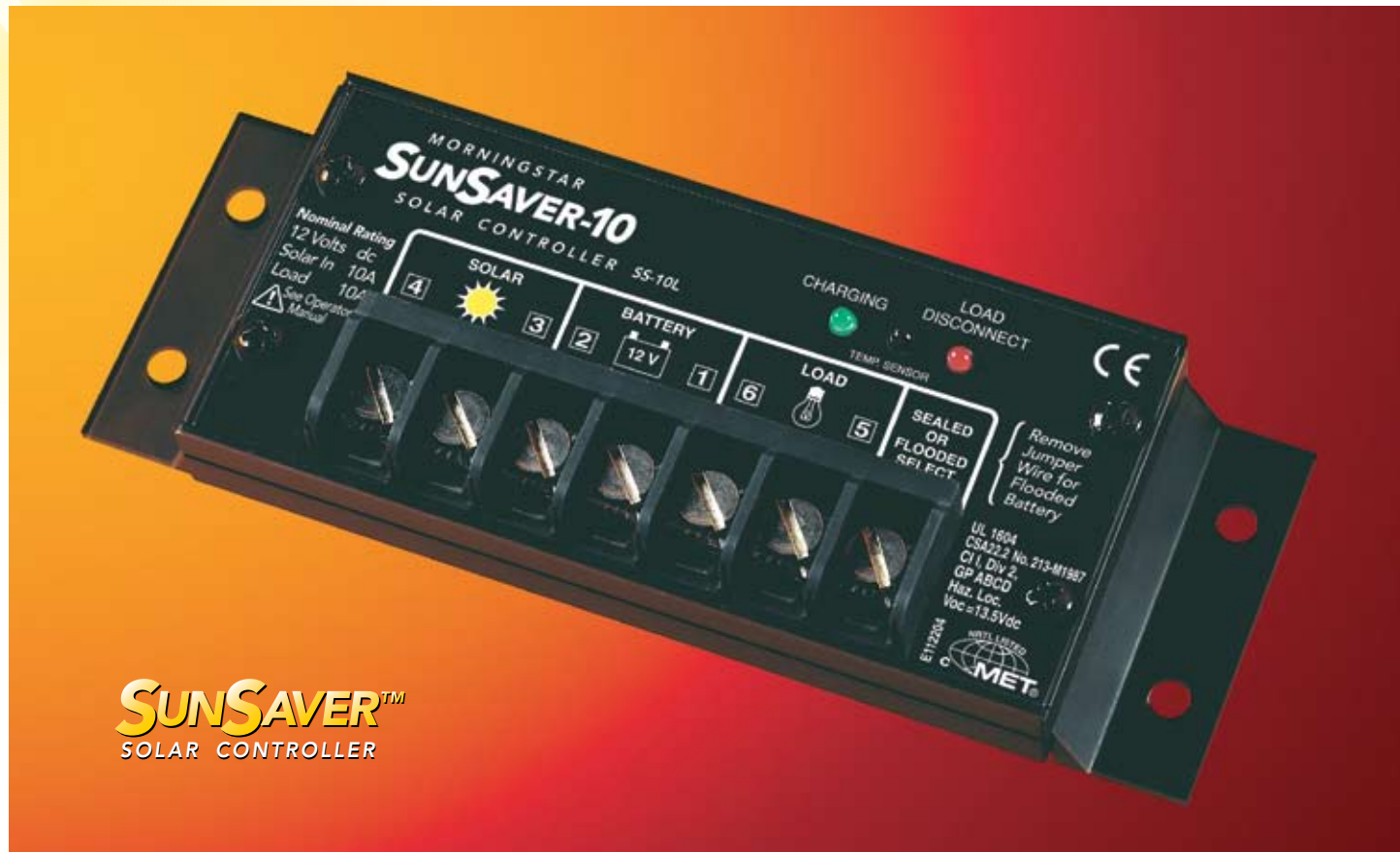
SUNSAVER™ SOLAR CONTROLLER

Morningstar's SunSaver is the world's leading small solar controller for both professional and consumer applications.